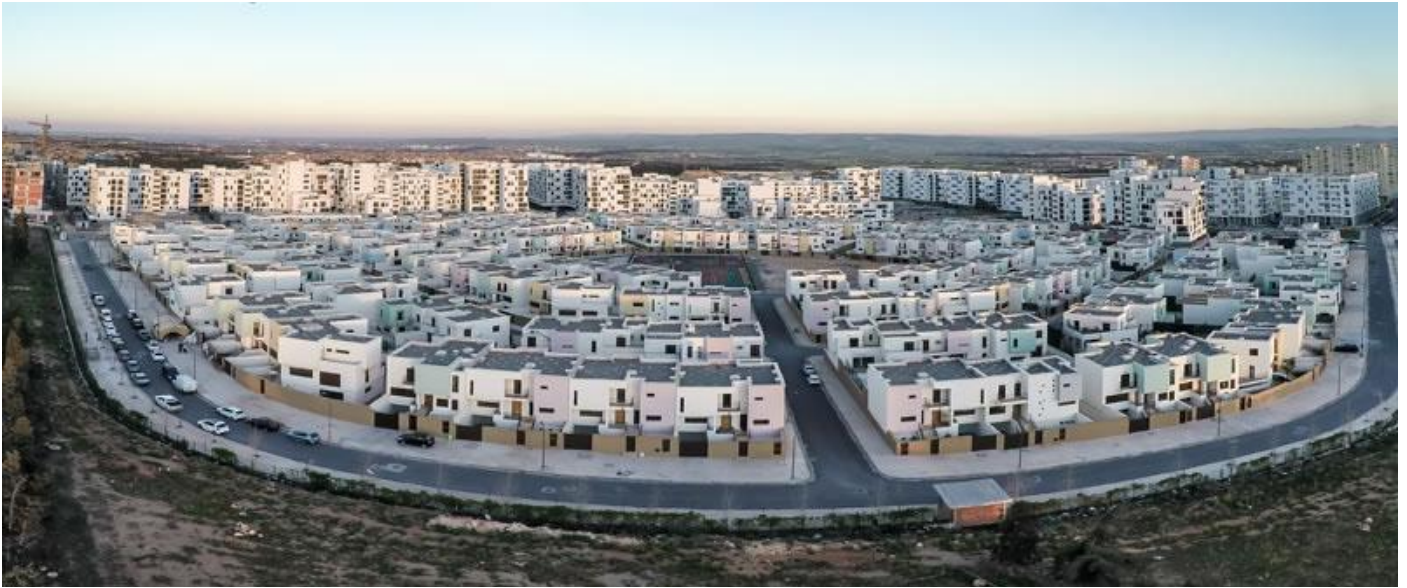
Fig. 2. An overview of the ERRIADH district.

The profile we are going to illustrate was developed the basis of an empirical survey combining two methods, the first being the involvement of users in the assessment of their neighbourhood via a self-administered questionnaire to a selected sample of the target population; and the second being participant observation for the points that cannot be dealt with by an ordinary user. The questionnaire distributed to the target population initially involved 500 people, but because 138 questionnaires were not completed, a total of 362 respondents (owners of single-family dwellings in the neighbourhood in question) participated in the study. The stratified random sampling method was applied to improve the accuracy of the data processing (Hervé and Marois, 2000). (Stratification concerns the percentage of flats compared to villas). We considered this sample size to be appropriate, since with an average margin of error of 5% and a confidence interval of 95% (common values predefined by the calculator), DATAtab's calculation of the sample size gives us a value of 316 participants out of a total number of 1,772 (taking into account the factor of exclusion from the sampling: belonging to the same cell, which can distort the results by redundancy of information).