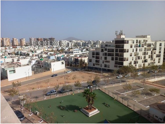
Fig. 3. View of the different parts of the project at different densities. (Source: Authors, 2024)