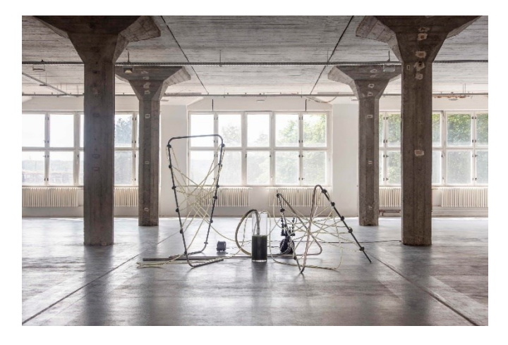
Fig. 9. Photosynthetic Landscape, Pragovka Gallery, installation.

cultures. This project is a valuable reference for understanding the practical implications and complexities of maintaining algae cultures outdoors. Overall, the Pragovka Gallery courtyard installation symbolized the team's attempt to address the complex relationship between human, non-human, and technology applications as the bridging element. It served as a tangible representation of the need to create cohesive systems that have the potential to coexist with the natural environment and the demands of current societal challenges. The bacterial and fungal contamination, which occurred to the medium in the last week of the installation, also paralleled, as a metaphorical reflection, the vulnerability and fragility experienced during this unprecedented time of social distancing and isolation.