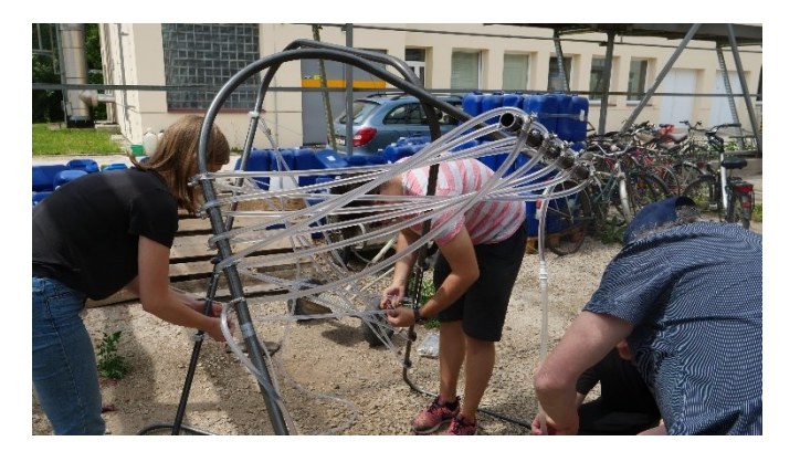
Fig. 4. Photosynthetic Landscape, workshop at the Algatech Centre.

At the initial workshop at the Algatech Centre (Fig. 4), supervised by Prof. Jiří Masojídek, the cultivation techniques and practices were worked out. According to that, the initial concept and model for the exhibition project Photosynthetic Landscape was designed and constructed, consisting of an aluminium scaffolding carrying transparent PVC tubes. The idea was tested in various spatial settings and installed at the Landscape Festival 2020 in Prague, Czech Republic, in the exterior of the Nevan Contempo Gallery. Within the installation, 17 pyramid-like loops were connected and intertwined with the tubes. The overall structure demonstrated a manifold PBR system – an interconnected network of tubes exposed to direct sunlight to facilitate photosynthesis (Fig. 5). The system, connected by water and air pumps to the central reservoir (Fig. 6), was maintained continu-