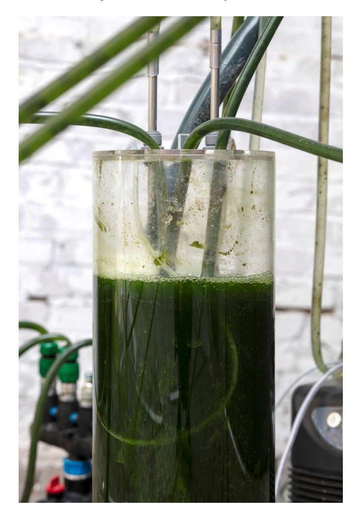
Fig. 6. Photosynthetic Landscape, detail of the culture reservoir and degasser.

neers, electricians, and other PBR specialists. Their expertise and insights contributed to refining the technical aspects of closed cultivation units. This collaborative approach enabled the project team to learn through on-site experience. One potential limitation of the approach was its seasonality. Chlorella cultures perform well within a temperature range of 15-25 degrees Celsius. Therefore, operating the structure seasonally outdoors is necessary. Running the system during warmer seasons offers enhanced photosynthetic efficiency advantages, as it can utilize natural sunlight instead of relying solely on artificial lighting, which would require additional electricity.