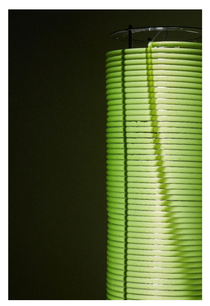
Fig. 14. Exchange Instruments, UM Gallery - detail, Prague, Czech Republic.

functionality by utilizing laboratory glass, which possesses essential properties for various applications. These properties include high resistance to chemical corrosion, excellent transparency for observing cultures, and the ability to withstand extreme temperature variations, ensuring the integrity and durability of the installation throughout its lifespan. On the other side, working with laboratory glass with such specific geometry was problematic in terms of maintenance and fragility, as the spiral had to resist constant vibrations and motion of liquid pumping in and out of the attached water pump. That, with the overall weight of the liquid, caused several cracks in the glass, which had to be fixed during the exhibition, and later maintained.