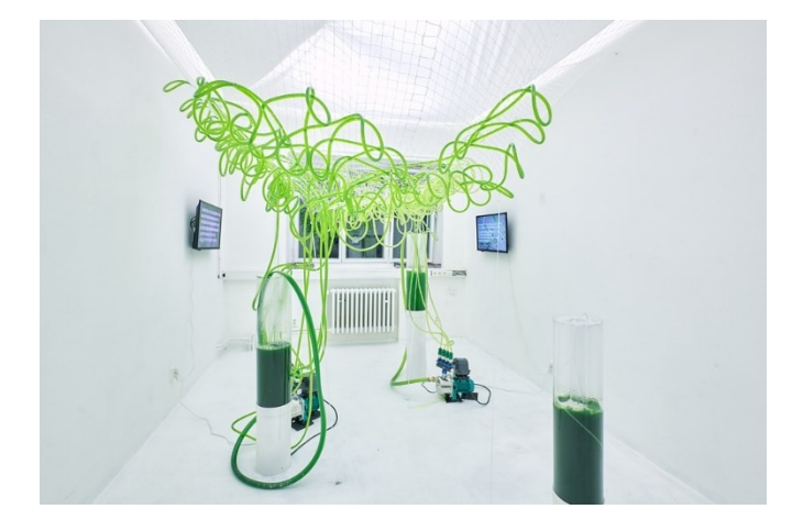
Fig. 10. Microflows, Designblok 2020.

addressed the topic of potential air purification during a time of heightened global insecurity. With the COVID-19 pandemic affecting communities worldwide and raising concerns about air quality and health, the installation's focus on the potential of microalgae to contribute to cleaner air excited the visitors. After installing Microflows, the cultures were maintained in the interior space and aerated for two months, serving as a valuable plant fertilizer for the indoor plants.