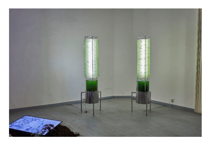
Fig. 13. Exchange Instruments, UM Gallery - installation, Prague, Czech Republic.

The project combined various disciplines and crafts to create a functional and aesthetically appealing installation. The employed methodology revolved around fostering collaborations with glassmaking and welding companies, allowing to integrate their expertise into the fabrication process. A collaboration with a glass-making company was established to bring the concept of the one-meter-high glass spiral structure to life. Through continuous discussions with the artisans, the spiral design was given specific dimensions based on the company's technical abilities. The glass spiral had a specific function and served as a light-harvesting system for the culture medium while being edgeless to avoid sedimentation in the crevices. It housed a light bar with LED illumination, providing optimal light intensity for microalgae growth regardless of the natural light supply.