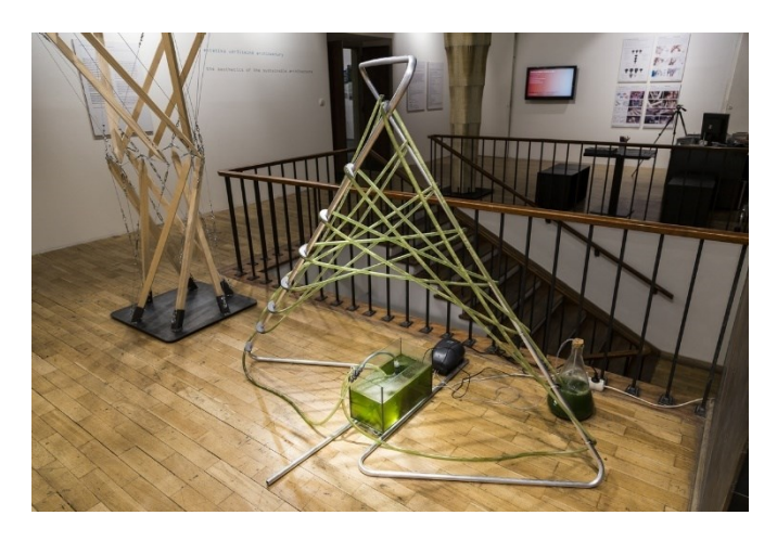
Fig. 7. Photosynthetic Landscape, Jaroslav Fragner Gallery, installation.