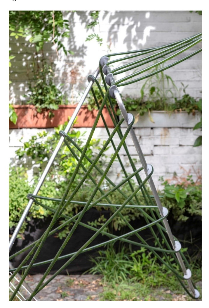
Fig. 5. Photosynthetic Landscape, detail.

ously for two months. Microalgae from the reservoir were distributed to the transparent tubes through the loops to receive light and circulate.