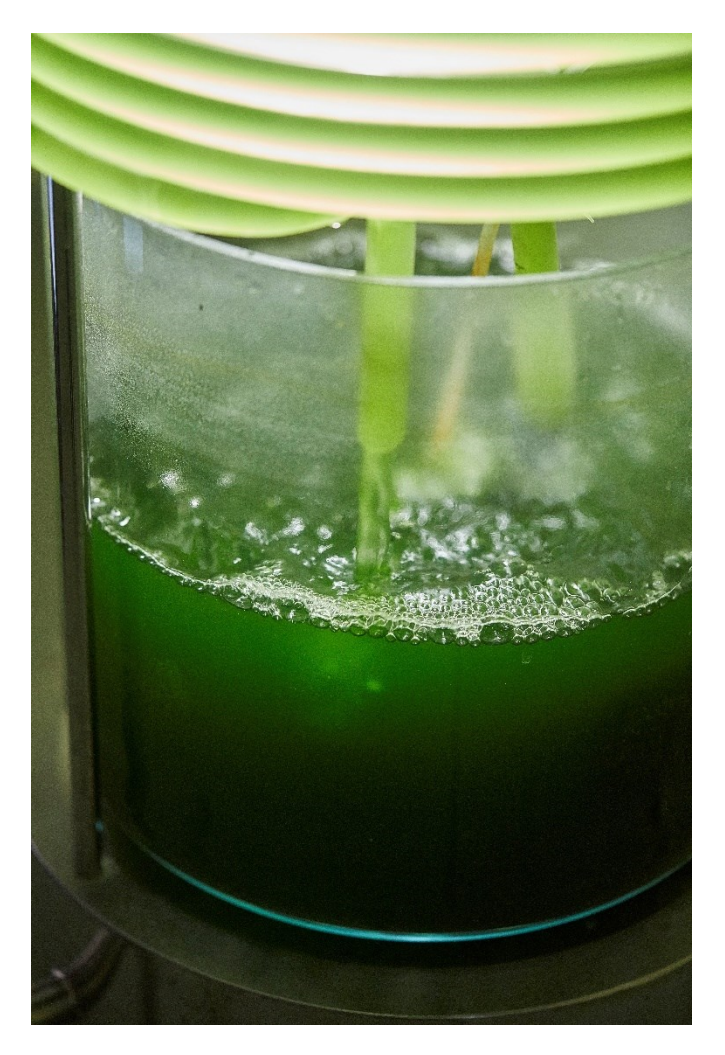
Fig. 15. Exchange Instruments, UM Gallery - detail, Prague, Czech Republic.

tion of the glass spiral and supporting structure, showcasing the potential of interdisciplinary cooperation in artistic and scientific endeavours.