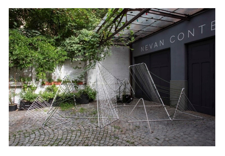
Fig. 3. Photosynthetic Landscape installed in the courtyard of Nevan Contempo Art Gallery in Prague, Czech Republic.

As an outcome, a modular PBR system was constructed and placed outdoors. The project's primary objective was to assess the technical aspects of closed cultivation units. To achieve this, the outdoor installation ran continuously for two months, allowing for the evaluation of the overall health and efficiency of the culture. The executive team responsible for the project consisted of researchers and Ph.D. students of architecture as part of the Architecture III Studio at UMPRUM, and the tasks have been regularly consulted with the studio professor. The team explored new spatial configurations for exterior closed PBR units, which could provide shade and enhance the system's performance.